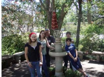
Rested and ready, the kids set out to capture our campus on camera, yielding artistic close-ups of images strange yet somehow familiar. See if you can place them all...